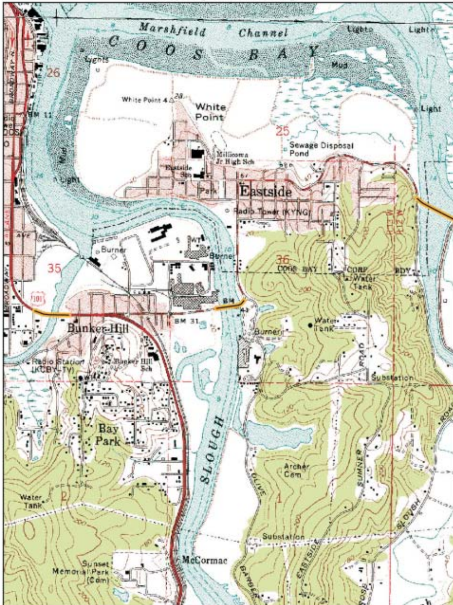
Coos Bay: Isthmus Slough